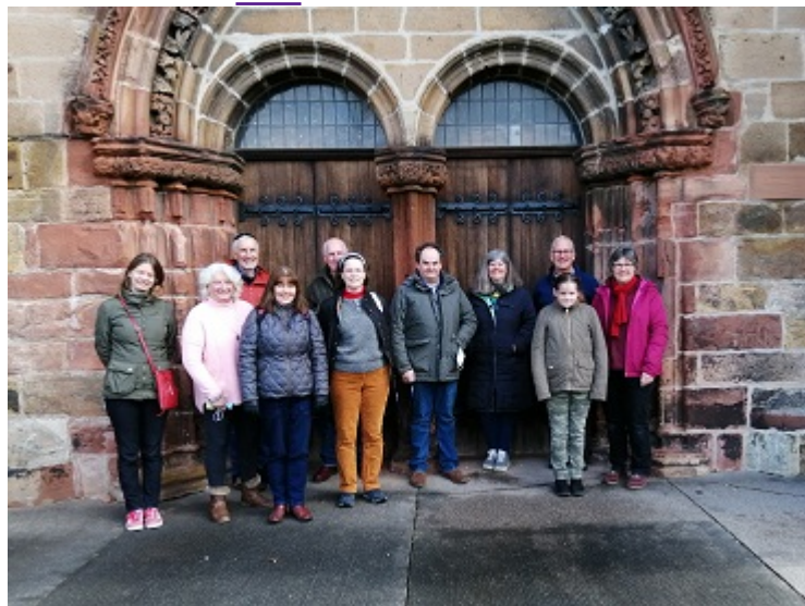
Some of the course participants and tutors after the final session of the course