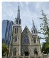
Moly Rosary Cathedral, Vancouver and below the North West and Ireland topics

Over the years, to try to get a more varied ringing experience, I have taken various opportunities to ring whilst on holiday. The most memorable of which was in Vancouver, British Columbia. My daughter lived there for 5 years and when visiting her in 2019, my wife and I were very lucky to discover that our trip coincided with the annual weekend visit from the Seattle ringers, so tower sessions were available Saturday and Sunday. We chose to ring on both the Saturday morning and afternoon, shared a ceremonial lunch with everyone and then joined them all for a very well organised dinner in the evening at Vancouver Lawn Tennis Club, including speeches, handbell ringing and awards. The locals didn't mind that we had only been ringing for a couple of years. They made us very welcome and gave us plenty of opportunities to practise and socialise with like-minded folk. Since then we've even managed to meet up in Scotland to ring with one of the people we originally met in Canada!