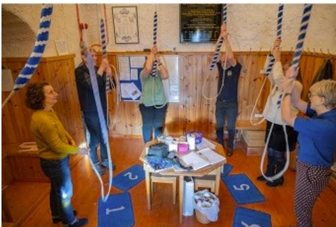
St Machar's, Aberdeen