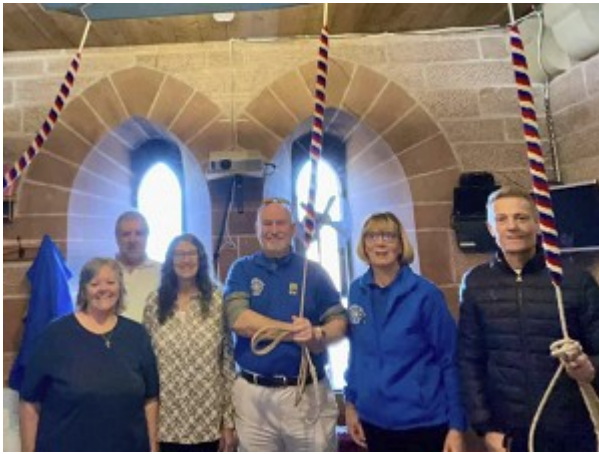
St John's, Dumfries