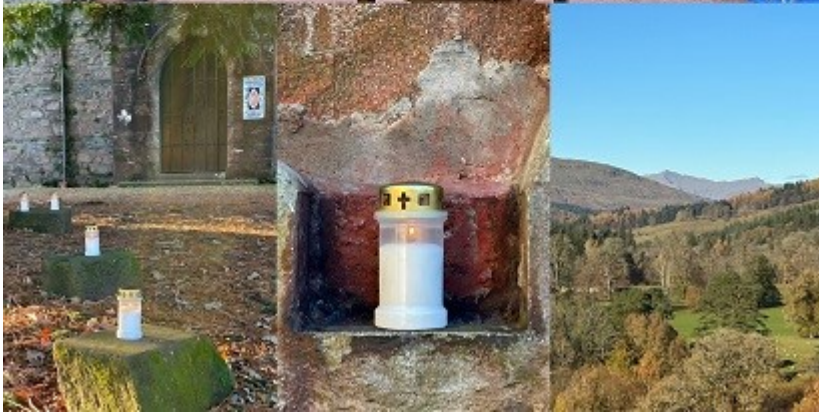
All Saints, Inveraray